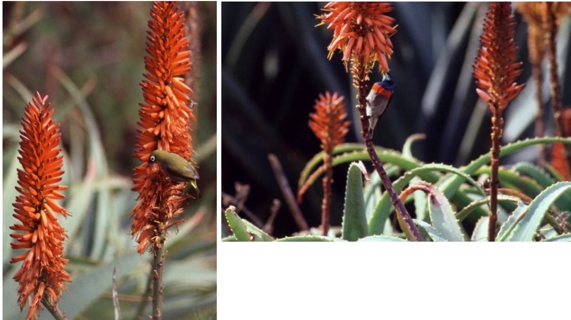
Cape White-eye: above, left; Lesser Double-collared Sunbird: above, right.

Cape White-eye Zosterops capensis pallidus – Common.