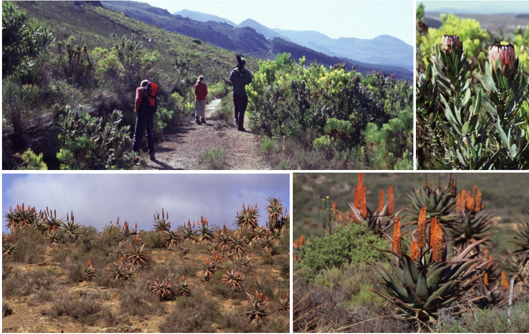
18 July Drive via gravel roads -part of the "farmland loop"- to De Hoop NR. Many birds and mammals, including Blue Crane, Stanley Bustard and Yellow Mongoose.