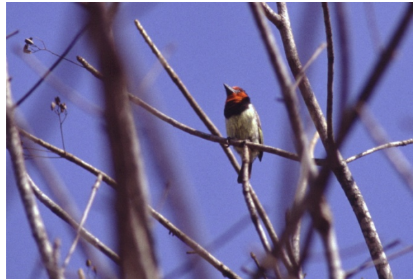
Crested Barbet: above, left; Black-collared Barbet: above, right.