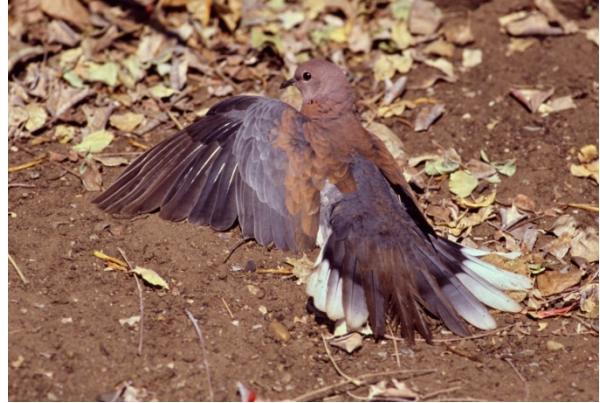
Red-eyed Dove: below, left; Laughin Dove: below, right.